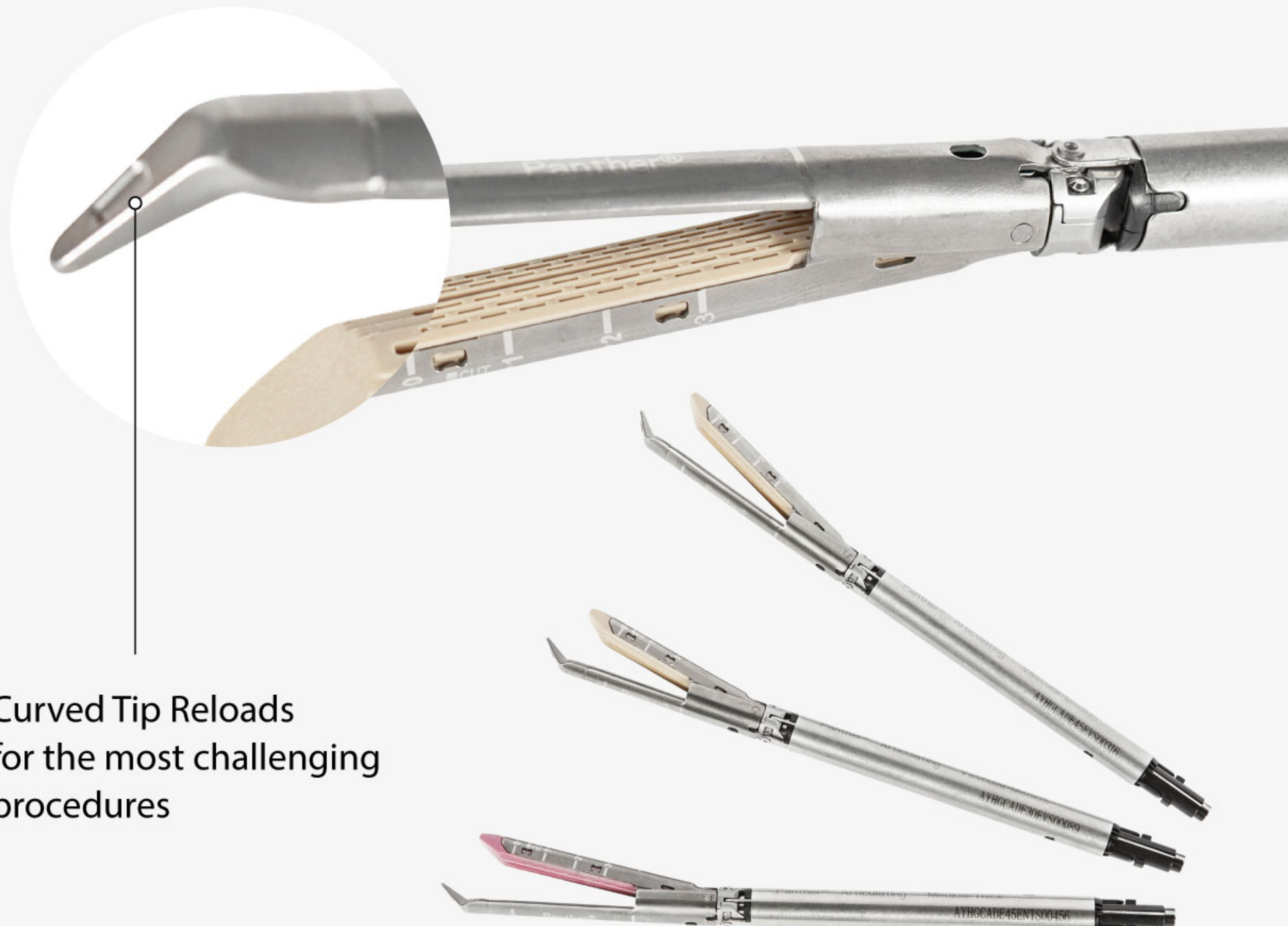
Curved Tip Reloads for the most challenging procedures